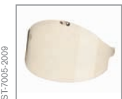
Replacement visor Anti-scratch (AS/AS) coating on both sides R 57 410