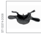
Nomex/Belgian type Three-layer, high-quality Nomex/Aramide fabric, antistatic, resistant to many acids, alkalis and alkaline solutions R 56 621