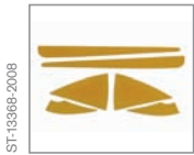
Reflective strips (special design) Style Wing 1 Lemon-yellow R 56 198 Ruby-red R 56 199

The front plates are available in different colors and equipped with extra rubber rings.