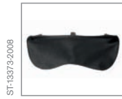
Nomex Short and tight fitting, Nomex impregnated with fluorocarbon R 56 620