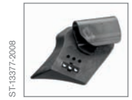
Lamp holder S-Fix Of high-temperature-resistant black plastic R 56 700