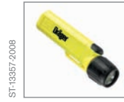
Lamp UK 4AA-ES1 Helmet lamp with highest EX protection class R 56 109