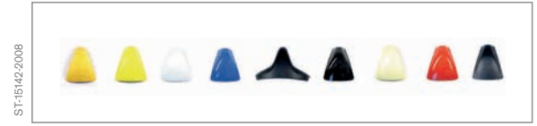
R 56- -012 -020 -011 -013 -044 -017 -018 -014 -029