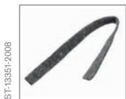
Additional pad For head sizes 50 to 51 R 56 072

Additional accessories provide even greater protection to the wearer.