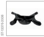
Wool Long (Dutch type), 100% wool, oil- and water-repellant, flame-retardant, edged at bottom with Nomex III R 56 623