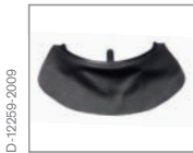
Leather Protection against embers, ashes etc. R 57 405