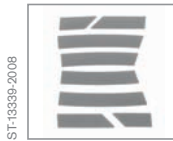
Set of reflective strips Silver R 56 029 Yellow R 56 141 Adhesive template set R 56 120