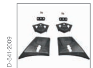
Mask adapter retrofit kit Q-Fix Fixing to position points on the helmet instead of the mounted plate for S-Fix R 56 824