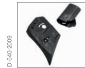
Lamp holder Q-Fix Made of high-temperature-resistant black plastic R 56 950