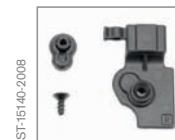
Adapter for communication system Right R 56 825 Left R 56 826