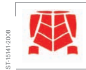
Reflective strips (special design) Style Wing 2 Lemon-yellow R 56 396 Ruby-red R 56 397