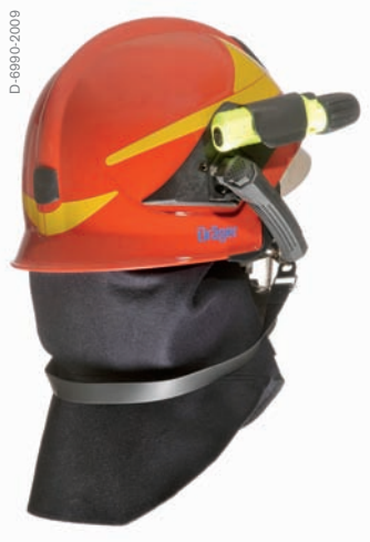
Dräger HPS 6200 with Q-Fix adapter