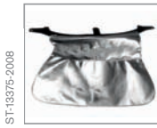
Nomex/Aluminum Aluminized with reverse side of Nomex III R 56 622

Dräger lamps are exceptionally bright, particularly light in weight, and robust.