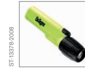
Lamp UK 4 LED High-power lamp with new LED technology R 56 724