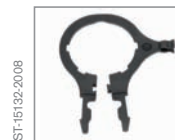
Adapter ring for Savox coms R 56 828