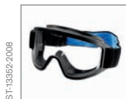
Safety goggles Black, visor of polycarbonate (2 mm), anti-scratch and anti-fog coating, optical class 2 and ballistic protection class B R 56 076