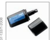
Anti-fog agent For all visors R 56 542