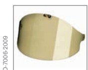
Replacement (anti-scratch) visor Gold-coated visor of 2 mm polysulfone R 57 409