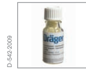
Paint repair kits (For color selection, please refer to the front plates)