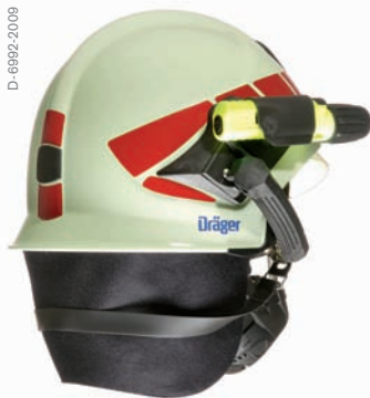
Dräger HPS 6200 with S-Fix adapter